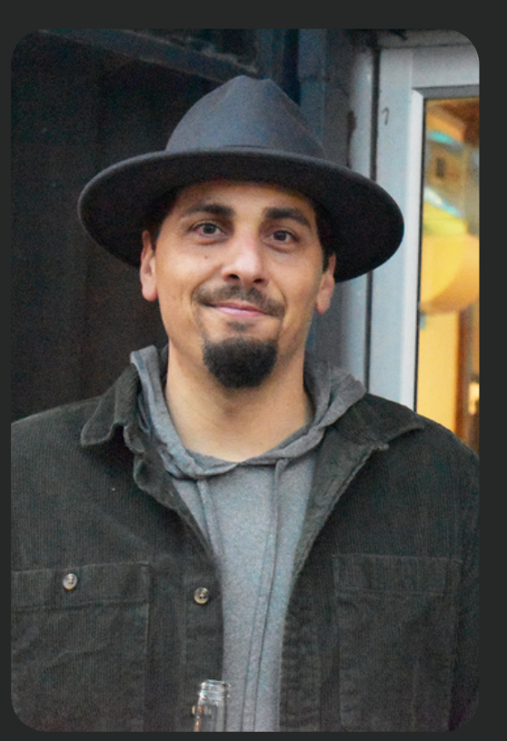
Rizoma Liquid Creations Brewery Concept