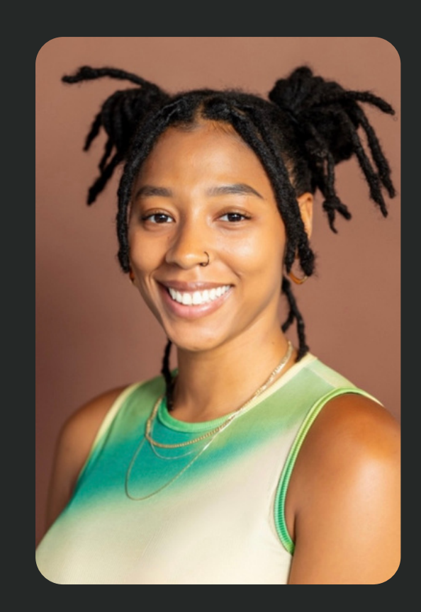
CrazySexyCraft Beer Education & Experiences

Crafted Fellows is an annual accelerator program that supports and empowers BIPOC owned beverage industry businesses by offering strategic support during the Crafted for Action Craft Beer Conference and beyond.