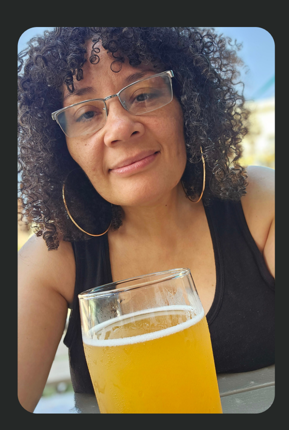
Excited to Feast Beer Education & Experiences