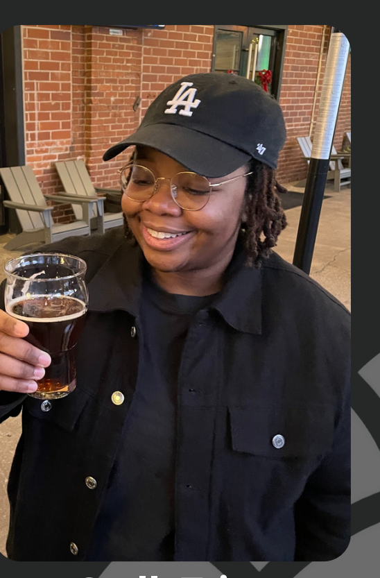
StellaTripp Brewing Brewery Concept