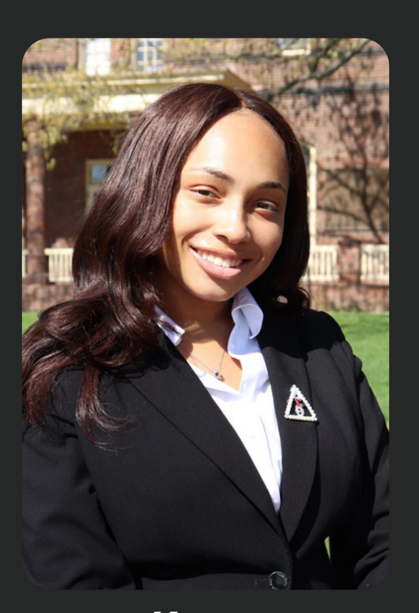
Krave Ready to Drink Cocktail Brand