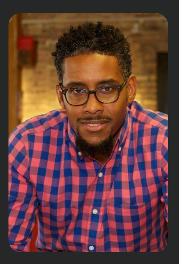
Deuce & a Quarter BrewPub Concept