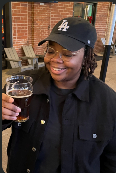
StellaTripp Brewing Brewery Concept