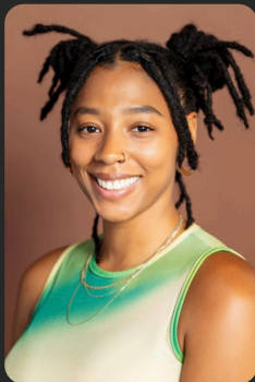
CrazySexyCraft Beer Education & Experiences

Crafted Fellows is an annual accelerator program that supports and empowers BIPOC owned beverage industry businesses by offering strategic support during the Crafted for Action Craft Beer Conference and beyond.