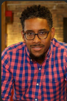
Deuce & a Quarter BrewPub Concept