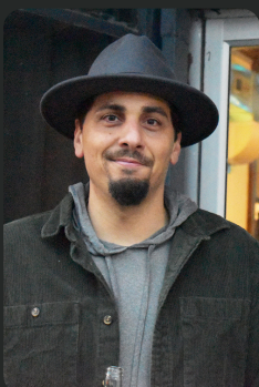
Rizoma Liquid Creations Brewery Concept