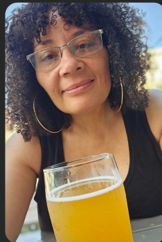
Excited to Feast Beer Education & Experiences