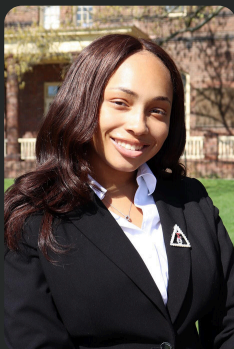
Krave Ready to Drink Cocktail Brand